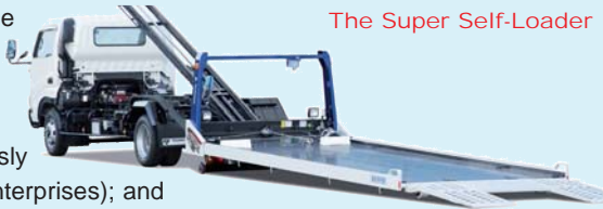
The Super Self-Loader

Three processes are carried out here: mounting work for the Super Self-Loader (previously done by the SS Manufacturing Section); mounting work for TM Series cargo cranes (previously handled by Tadano Enterprises); and on-site painting of cranes. The SS fabrication and TM mounting shops cover an area of 144 metres by 46 metres.