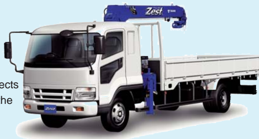
TM Series cargo crane