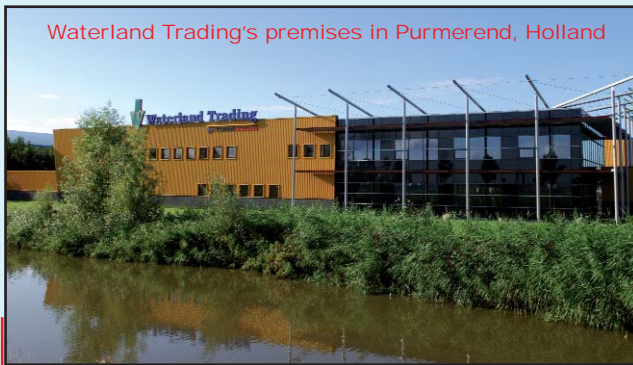
Waterland Trading's premises in Purmerend, Holland

As the company grew, it became too big for its premises in Broek in Waterland and moved to new facilities in Edam, the town most famous for its cheese. More recently it has moved again to a new business park in Purmerend, with 2,500 square-metres of workshop and 700 square-metres of