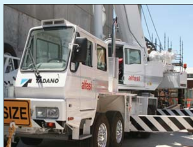
Alfasi Group's GT-550E at work in Melbourne

In the same state, Botany Cranes in Sydney and Boom Logistics in Newcastle are both proud owners of new GT-550E machines, while Abesque Engineering & Construction has one working at the Abesque Lake Cowell Gold Project.