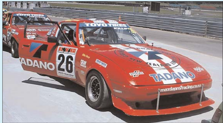
The Mazda race cars of Cranes International

The Pro 7 race series runs from October to April. There are 10 weekend meetings over the course of the season. The last meeting of the season this year is being held on the weekend of 7-8 April.