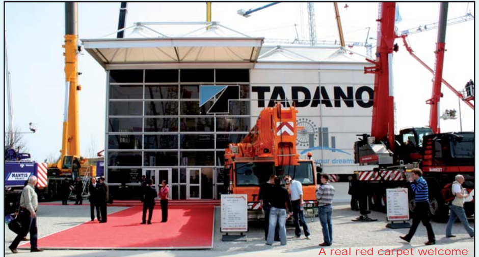
A real red carpet welcome