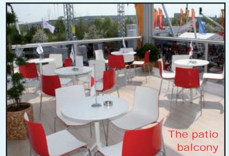
The patio balcony