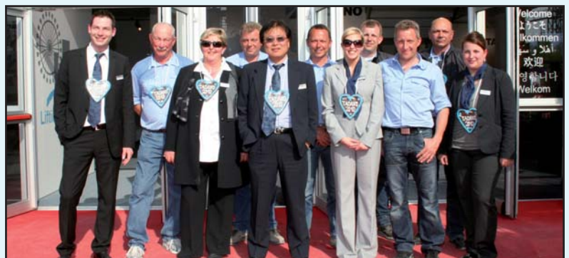
On the last day of the fair, after a busy week, the core team in charge of managing the pavilion assemble for a final photo call.