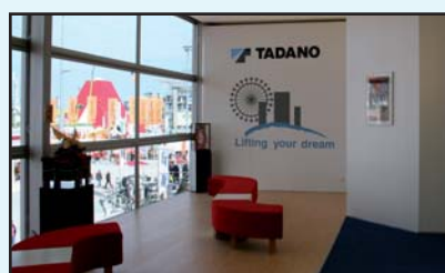
Left: The stylish lounge on the upper floor provided a place to meet and relax.