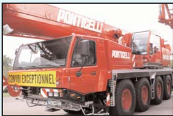
DHS has had most success with the ATF 65G-4 (above) and the ATF 90G-4 (below).

Volkswagen commercial vehicles. Another division hires out powered access platforms. In recent years Groupe Fabbri has also been active in the renewable energy business. Group turnover last year was € 105 million.