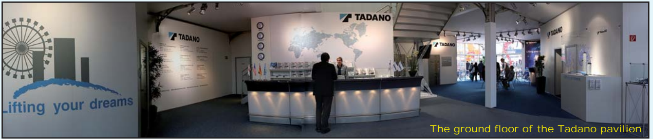
The ground floor of the Tadano pavilion