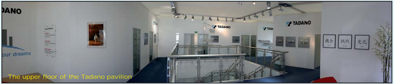
The upper floor of the Tadano pavilion