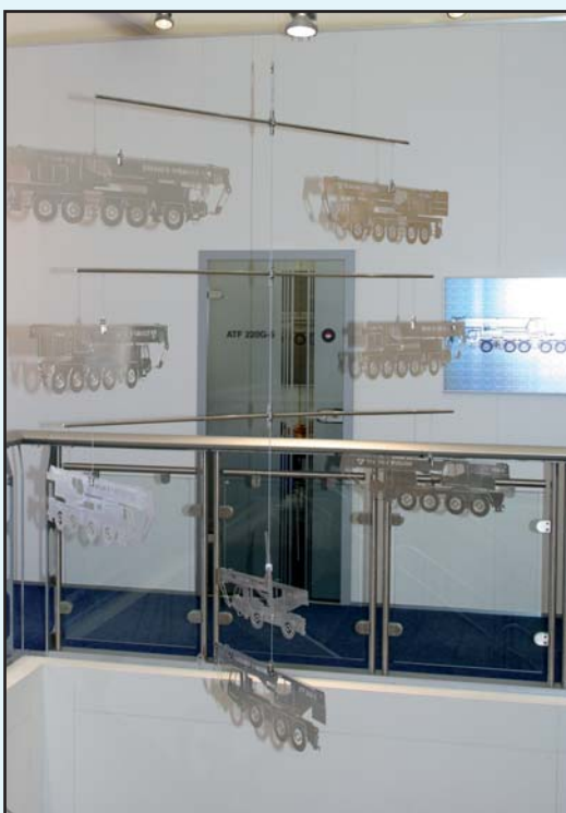
Left: A mobile made from mobile cranes. This artistic display of mobile cranes cut from steel plate, was created for the pavilion by apprentices at the Lauf factory, under the tutelage of Mr J Haas.