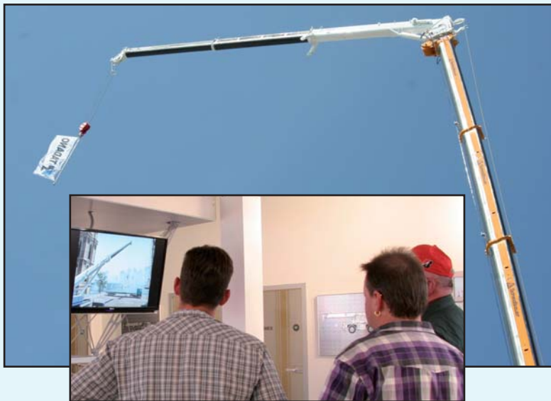
Above: A popular attraction in the Tadano pavilion was a video animation that demonstrates the hydraulically telescoping luffing jib (HTLJ) feature.