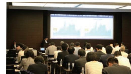
Financial results briefing for securities analysts (in Tokyo)

To prevent leaks of information on financial results and to ensure fairness, we observe a quiet period that begins the day after the end of the fiscal period and each quarter until the announcement of financial results. We will not be responding to or commenting on inquiries regarding financial results during this period.