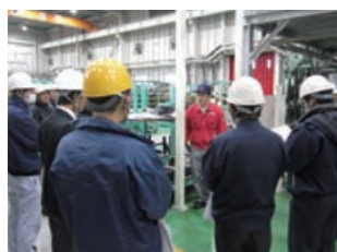
Plant tours by members of the Tadano Kyohei Society

In 1994, Tadano and its suppliers established the “Tadano Kyohei Society” with the aim of fostering an independent, solution-oriented organization with the competitive technologies and capabilities needed to survive in the 21st century. Since then up to the present time, we have developed and maintained lasting, strong relationships with our suppliers and worked with them for mutual growth and development. The organization is comprised of a total of 58 corporate members in Japan (as of April 2018). A variety of activities and events are held each year, including safety workshops, presentations on improvement initiatives, plant tours, and SVE conferences. The association also presents awards to suppliers with outstanding achievements each year.