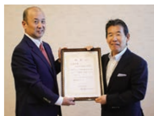
Annual supplier awards ceremony