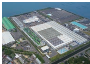
Solar panels installed at Shido Plant

energy use tend to be greatly affected by fluctuations in production output. Going forward, Tadano will continue to implement energy-saving measures, including improving the efficiency of our production facilities and introducing LED lighting. Tadano's model upgrades comply with new exhaust gas standards, and each segment has introduced eco-friendly products with features that minimize noise and other pollution. The CREVO G4 rough terrain crane series, which is equipped with Fuel Monitoring and Eco Mode functions, supports efficient and environmentally friendly operation such as by reducing CO 2 emissions, fuel consumption, and operational noise.