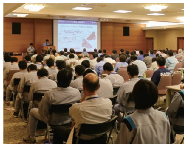
SVE Conference (presentation by a supplier)