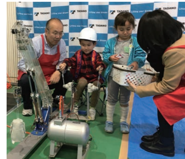
A child using the skeleton crane

Tadano supports an interactive science event held by local universities and other organizations to inspire children's interest in science. Children had the opportunity to use experimental tools to learn about the principle of the lever, Pascal's law, and the principle of the pulley. They also had great fun test-riding Tadano's aerial work platforms and operating a "skeleton crane" that runs on air pressure.