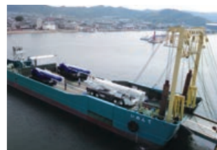
Using barges to transport products