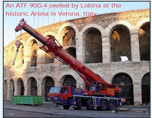
An ATF 90G-4 owned by Lobina at the historic Arena in Verona, Italy