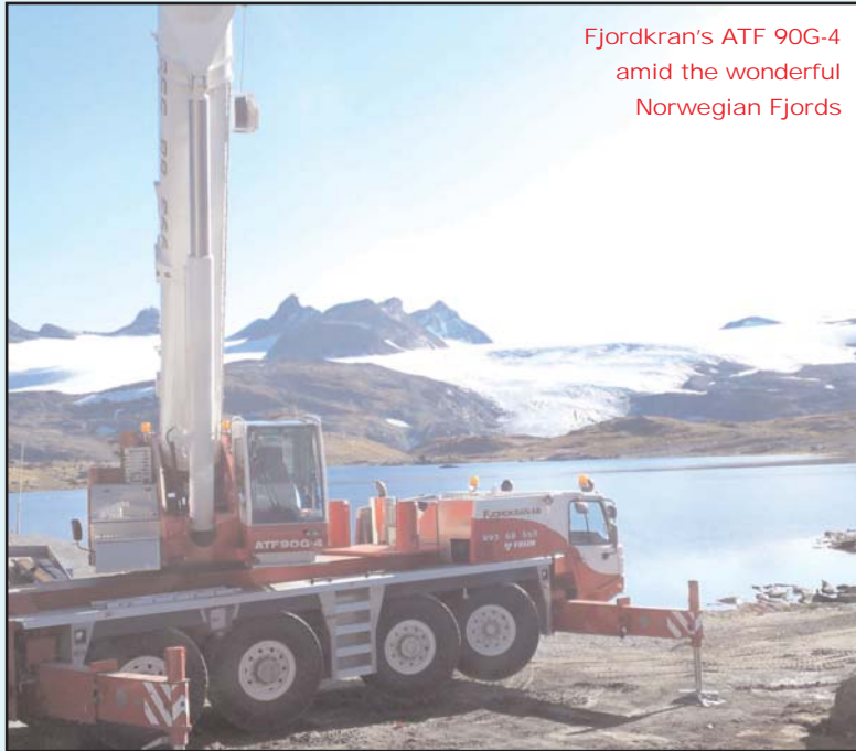
Fjordkran's ATF 90G-4 amid the wonderful Norwegian Fjords

Here is just a taste of some of the surprising and beautiful places we have found our ATF cranes at work around Europe. If you can match these, anywhere in the world, please send them in to us.