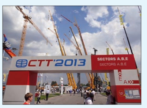
Tadano cranes could be found both inside and out at Moscow's CTT fair

They were among more than 1,000 exhibitors at CTT from approximately 30 countries.