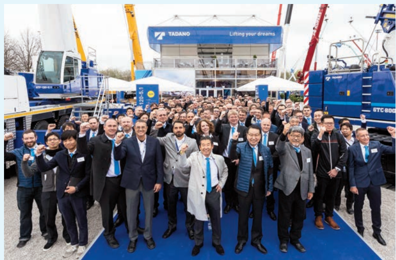
Above: The Tadano team at Bauma 2019