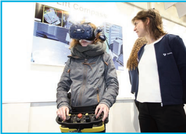
Tadano's Lift Compass

the crane in real time. It gives an instant check on the critical area, ensuring safe and reliable crane operation.