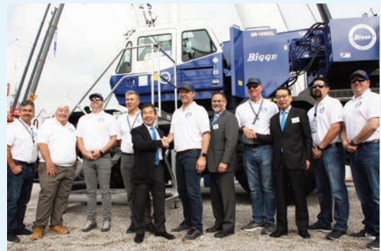
Above: US customer Bigge Crane & Rigging was formally presented with its new GR-1200XL