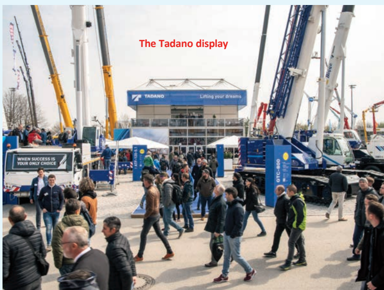
The Tadano display