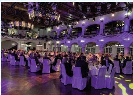
Tadano America's glitzy customer dinner

TO ALL WHO VISITED OUR STAND AT BAUMA 2019: THANK YOU!