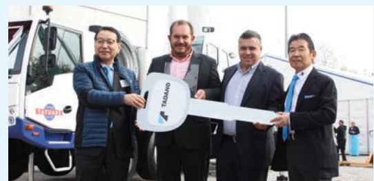
Below: Presentation of the key for a GT-750EL to Guindastes Tatuapé of Brazil