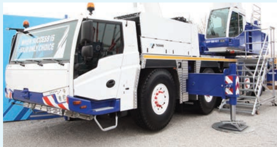
Below: The new five-axle ATF-120-5.1

Australian visitors studied the rough terrain GR-200EX that has been developed for their market. Four cameras give the driver complete peripheral vision around the crane while a fifth camera warns the driver of any difficult-to-spot objects approaching on the left side of the vehicle. Large-screen monitors were put up next to the crane to demonstrate this Tadano View System.