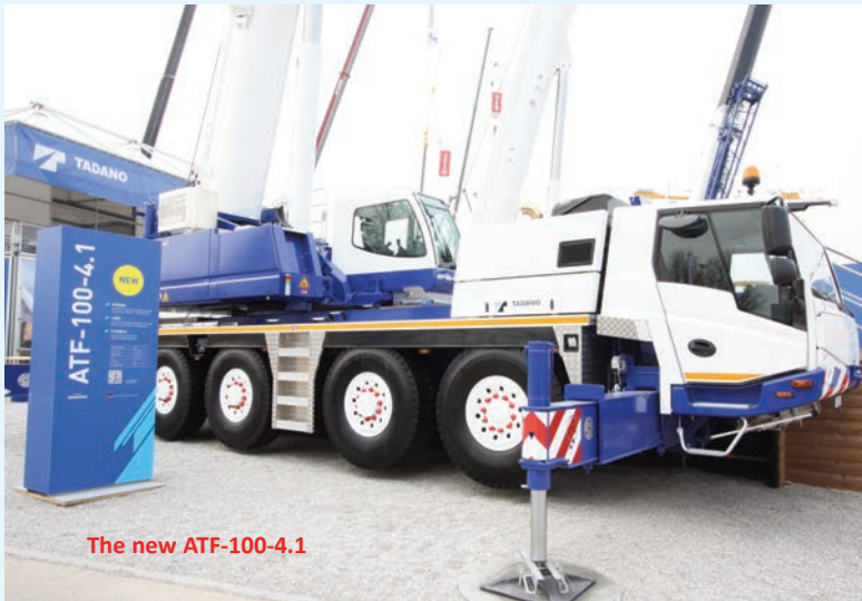
The new ATF-100-4.1

The new all terrain ATF-120-5.1 and ATF-100-4.1 captured the attention of visitors. Both cranes meet the Euromot Stage V emissions standard and share the same modular superstructure with a newly developed 60-metre main boom and 3.5 to 31.7-metre jib. Thanks to a hydraulic folding device, a solo operator can unfold the jib from the main boom and pin it via a crank handle from the ground.