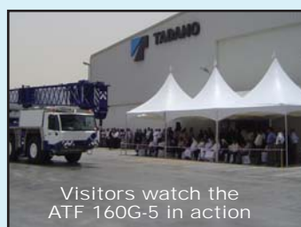
Visitors watch the ATF 160G-5 in action

General Manager of Tadano Middle East Representative Office, described the technical and safety advantages and explained how accidents can be prevented by the use of Tadano technology such as Lift Adjuster and Automatic Outrigger Length Detector.